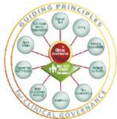
Figure 1 Guiding principles for clinical governance