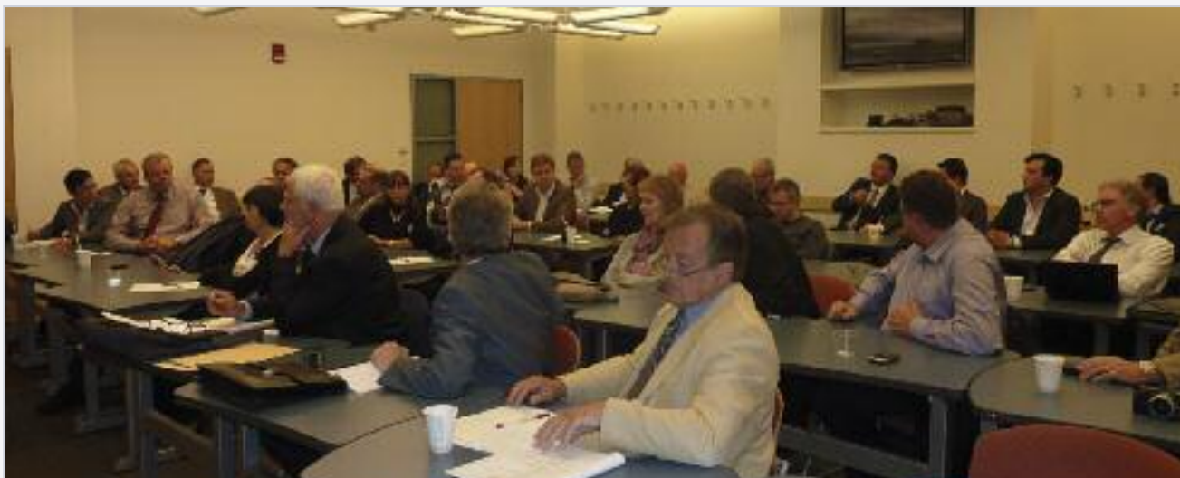
Members of the Belgian delegation participating in a Q&A after a presentation

Vice-President, Belgian Association of Hospital Managers Trip Organiser