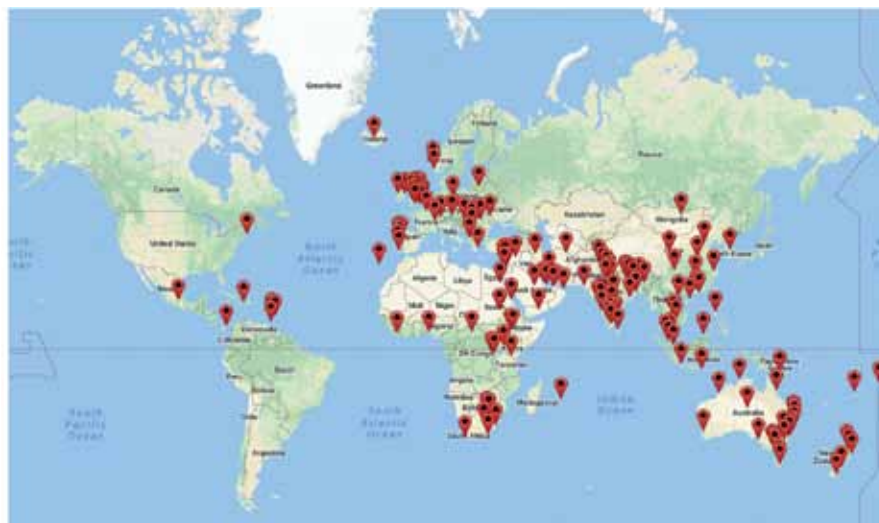
Figure 1. BASIC Collaboration course venues since 2004. Reproduced from https://multiplottr.com/?map_id=125266

The BASIC Collaboration was founded in 2004, with a logistic and administrative base