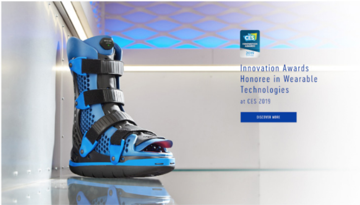
Figure 4: An example of smart anti-ulcer footwear

suffer from this complication, which leads to limb amputation if untreated. Therefore, multiple devices were developed to prevent and treat this condition: