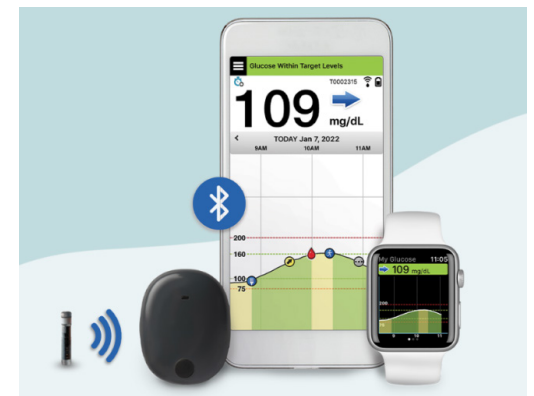
Figure 1: An example of the CGM system

Managing diabetes puts a strain on patients, mainly because of the amount of information they have to remember all the time.