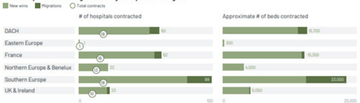
Figure 4. 2023 Hospital Wins & Migration – by European Subregion

to increase as Oracle Health i.s.h.med clients evaluate their options and more funding becomes available. Dedalus and CompuGroup Medical have been selected most in recent years in the region and currently stand best poised for future growth.