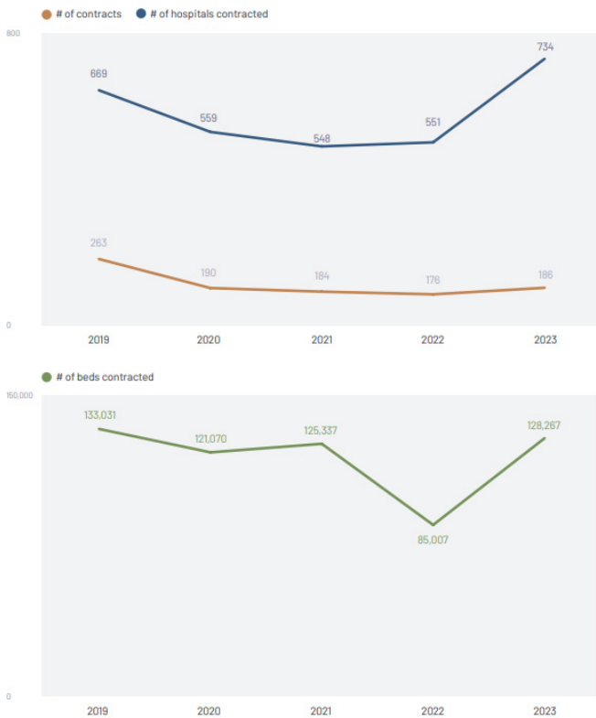
Figure 1. Hospital EHR Contracts, 2019-2023, all regions combined.

America, Canada, and Africa. Purchase energy was slower in both Asia and the Middle East (though KLAS currently has limited visibility into EHR purchasing in parts of Asia, such as China and India). Government initiatives and investments will likely continue to be a driving force in purchases across the globe.