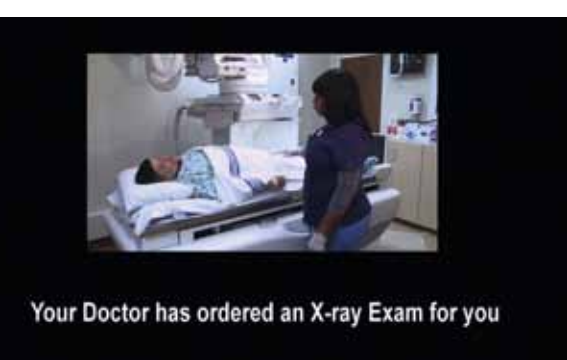
Figure 5. X-Ray Modality Video: Technologist preparing patient for X-ray exam.

comfortable with the technology. Despite the misconception that the elderly are afraid of or avoid such modern-day devices, we were encouraged to observe that our patient population brought and used their own personal tablets to the hospital during their outpatient visits.