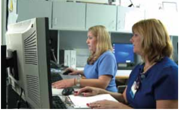
Figure 2. Coronary CTA Exam Video: CT Technologist and Nurse in the Control Room.

Figure 1, Coronary CTA Exam Video: Introduction