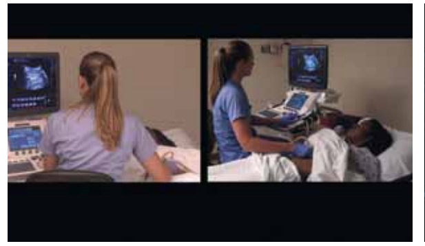
Figure 3. Ultrasound Modality Video: Sonographer performing an Ultrasound exam.