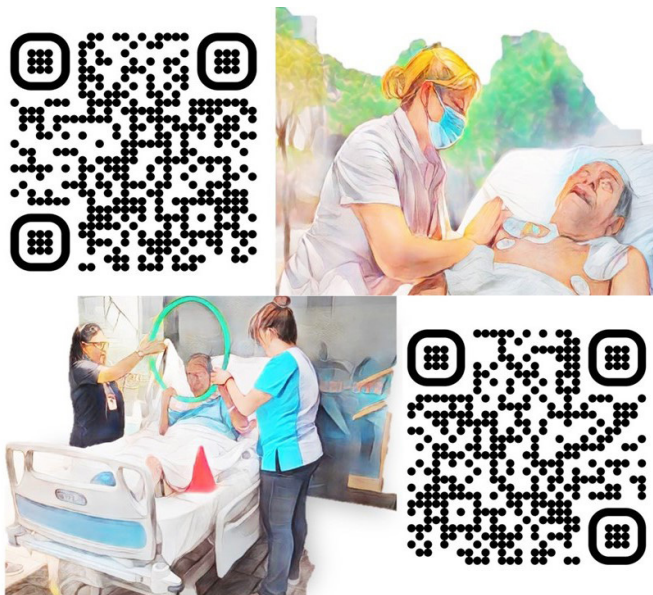
Figure 3. Intensive Care Unit (ICU) without walls. This multidisciplinary concept aims to integrate family members into the rehabilitation activity outside the ICU. Videos with QR codes are attached (photos authorised by the family members)

The administration of unwarranted deep sedation in a human being is a practice that should be severely penalised. This intervention, lacking adequate clinical justification, not only carries inherent risks and adverse outcomes, but also entails high human and financial costs. Furthermore, it perpetuates a questionable medical tradition that compromises ethics and patient safety (Hodgson et al. 2022).