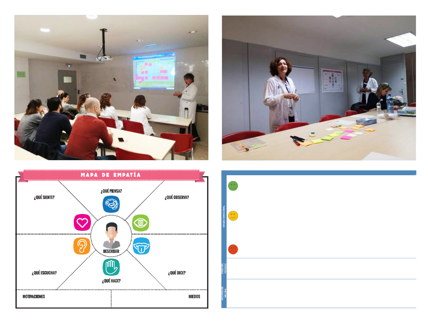
Figure 3. A Session with Haemophilia Patients. There, a Journey Map and an Empathy Map were drawn to collect the patient experience and detect potential changes in the process to add more Value to the patient.