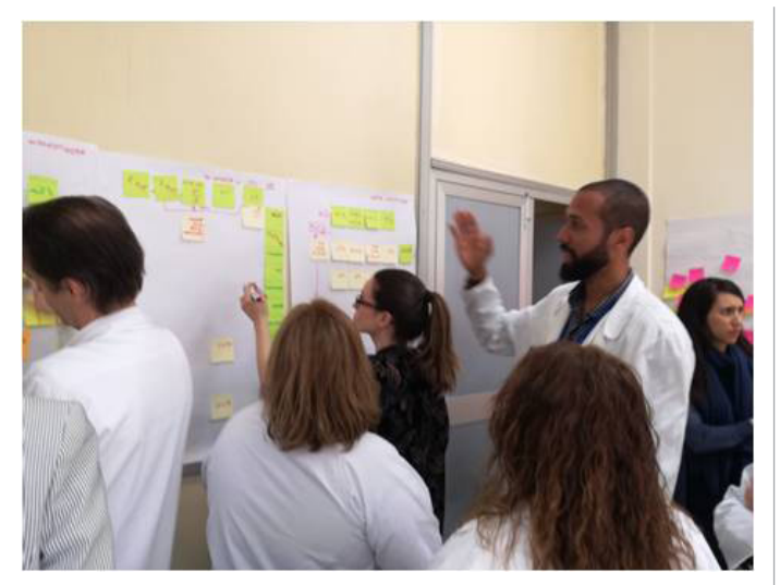
Figure 2. Localised Prostate Cancer Team Building the New Standard of Care.

cross-observation among professionals, a patient session, a development of the new working standard session and implementation of the improvement projects (Figure 1).